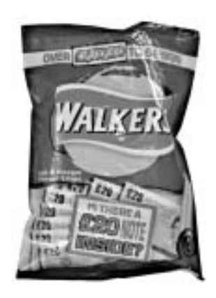
Figure 83 A real offer that targets an effective point of leverage. Your kids can always eat another bag of crisps. Reproduced by kind permission of Walkers Snacks Ltd.

And because it's a real offer in terms of the scale of rewards, it works. By this I mean the chances of winning are very high. It doesn't take long for the customer to get a reward – even if it's