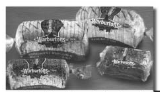
Figure 81 Simple but effective. A household couponing format that regularly doubled the industry-norm response.