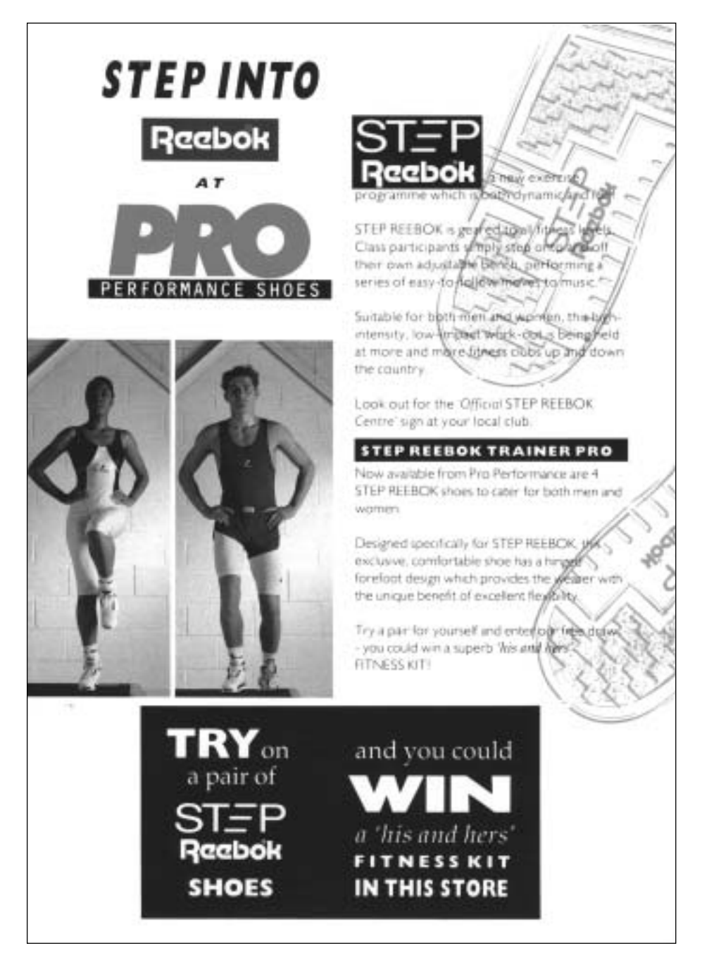
Figure 79 "Try to Enter" – a simple promotional mechanic that consistently reported a 70 percent trial-to-purchase conversion rate.