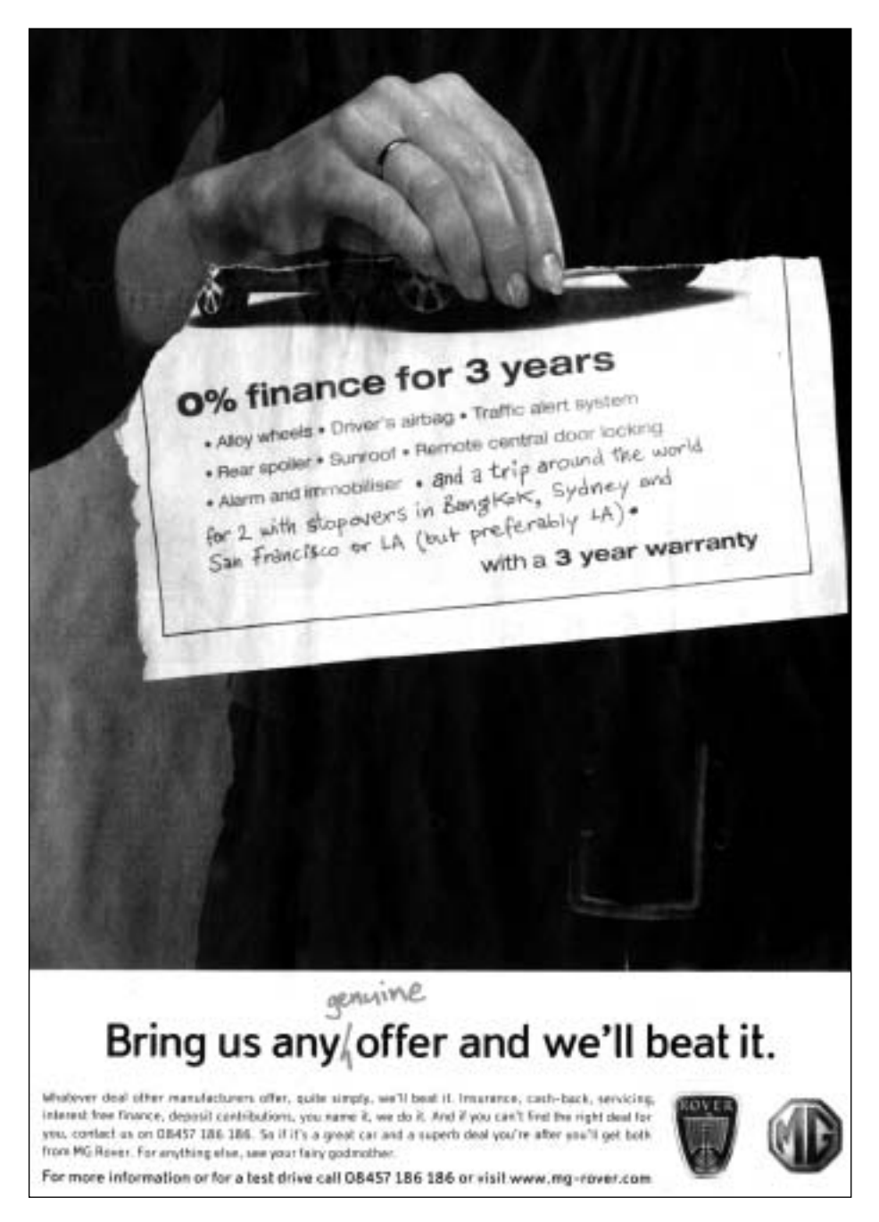
Figure 78 Tackling post-purchase dissonance ahead of the competition... and ahead of the sale.